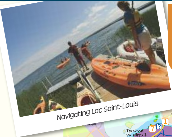
Navigating Lac Saint-Louis