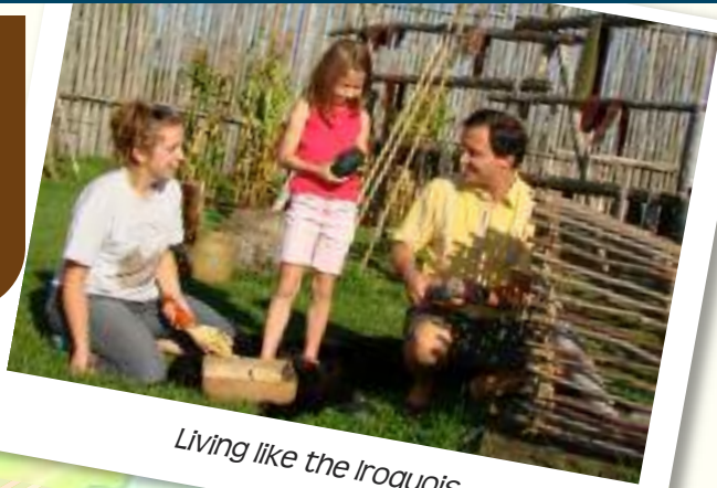
Living like the Iroquois

Ready for a change of scenery? On the southwestern tip of Quebec, let yourself be swept away by beautiful wetland vistas and fascinating archaeological discoveries. Witness breathtaking sunsets! Moreover, including archaeology, kayak, hiking and ornithology.